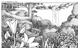
The Kingdom of Heaven Is at Hand.