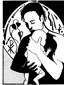
Happy Father's Day

Ordinary Income: June 12th/13th $13,879.00 Mission Cooperative: $ 5,376.00